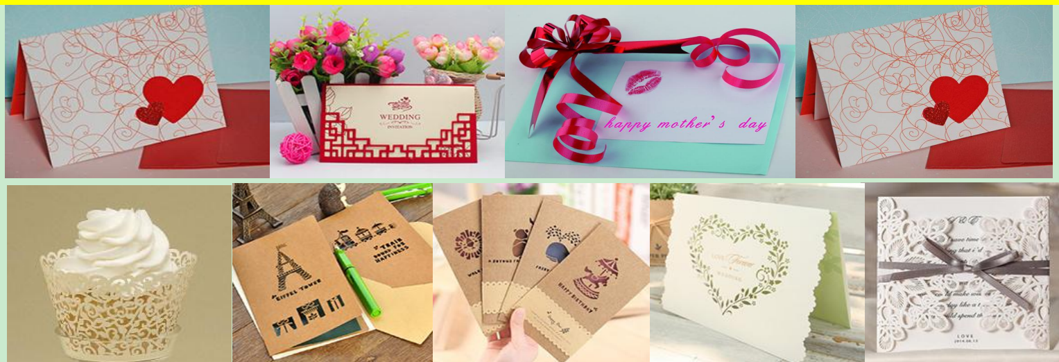
Invitation & Greeting Paper Card