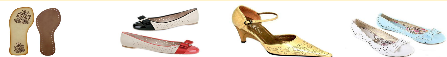
Shoes & Insole