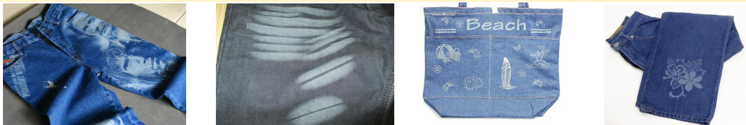
Jeans Laser Processing